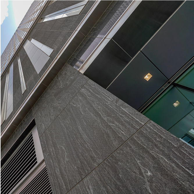
*Building photos are meant to demonstrate stone appearance and may not necessarily be taken from Litecore™ projects.