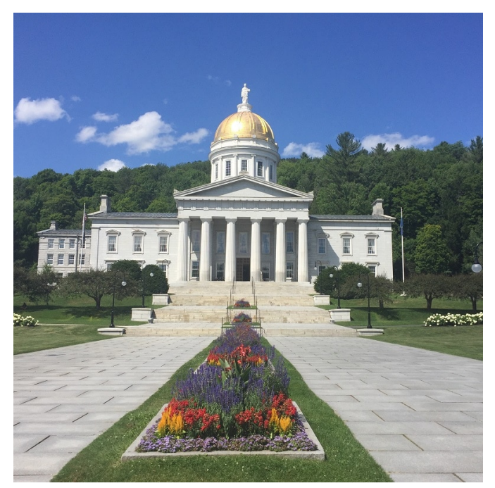
*Building photos are meant to demonstrate stone appearance and may not necessarily be taken from Litecore™ projects.