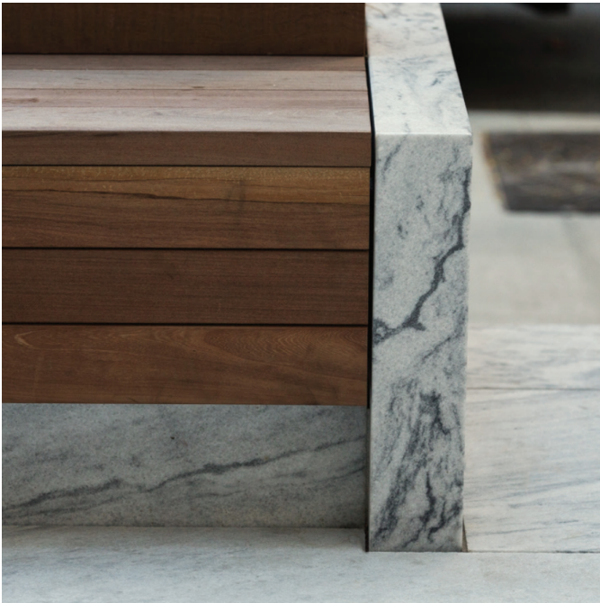
*Building photos are meant to demonstrate stone appearance and may not necessarily be taken from Litecore™ projects.