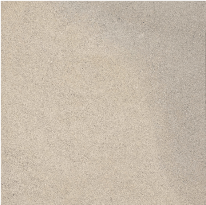
*Computer generated images and printed reproductions may not accurately match natural stone colors.