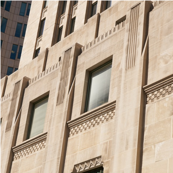
*Building photos are meant to demonstrate stone appearance and may not necessarily be taken from Litecore™ projects.