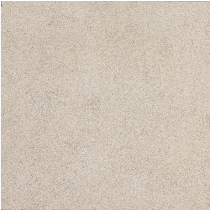
*Computer generated images and printed reproductions may not accurately match natural stone colors.