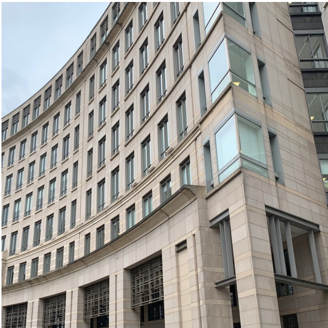
*Building photos are meant to demonstrate stone appearance and may not necessarily be taken from Litecore™ projects.