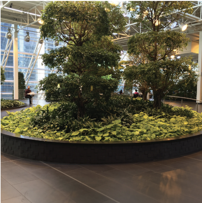
*Building photos are meant to demonstrate stone appearance and may not necessarily be taken from Litecore™ projects.