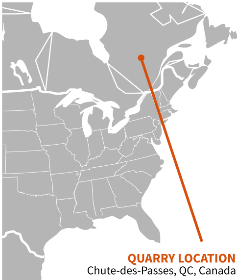
QUARRY LOCATION Chute-des-Passes, QC, Canada