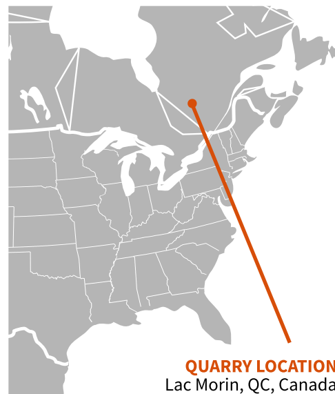
QUARRY LOCATION Lac Morin, QC, Canada