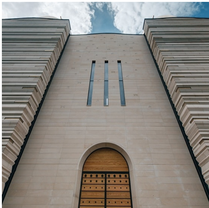
*Building photos are meant to demonstrate stone appearance and may not necessarily be taken from Litecore™ projects.