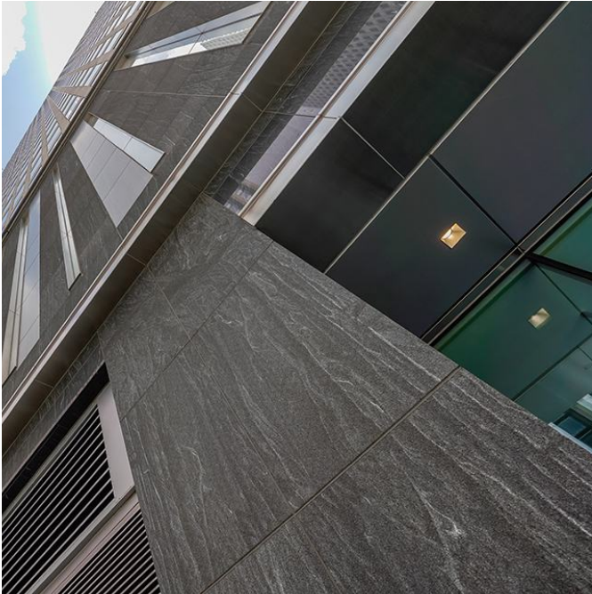
*Building photos are meant to demonstrate stone appearance and may not necessarily be taken from Litecore™ projects.