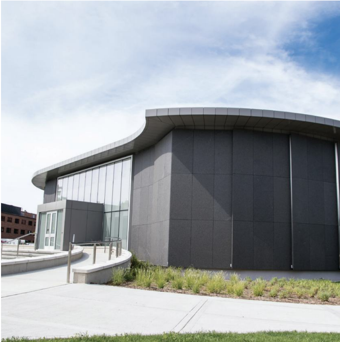
*Building photos are meant to demonstrate stone appearance and may not necessarily be taken from Litecore™ projects.