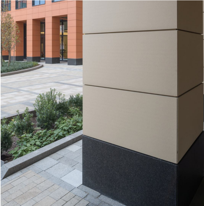
*Building photos are meant to demonstrate stone appearance and may not necessarily be taken from Litecore™ projects.